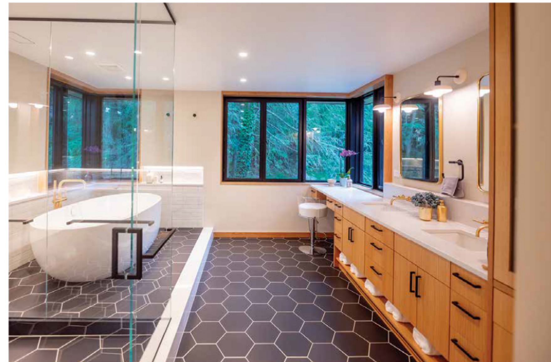
The addition's second floor created room for a soaking tub, glass-encased shower, and quartz vanity with a view on the backyard trees.

As part of the addition, Margittai remodeled the second upstairs bath with a generous walk-in shower and vanity. An added guest room overlooks the backyard oasis.