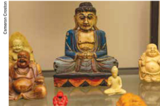
A bevy of Buddhas.