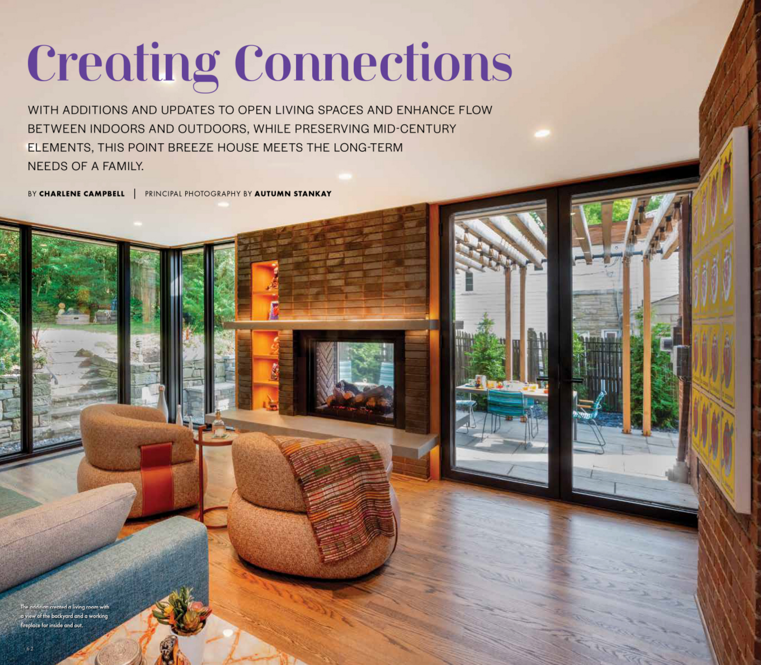
The addition created a living room with a view of the backyard and a working fireplace for inside and out.

BY CHARLENE CAMPBELL | PRINCIPAL PHOTOGRAPHY BY AUTUMN STANKAY