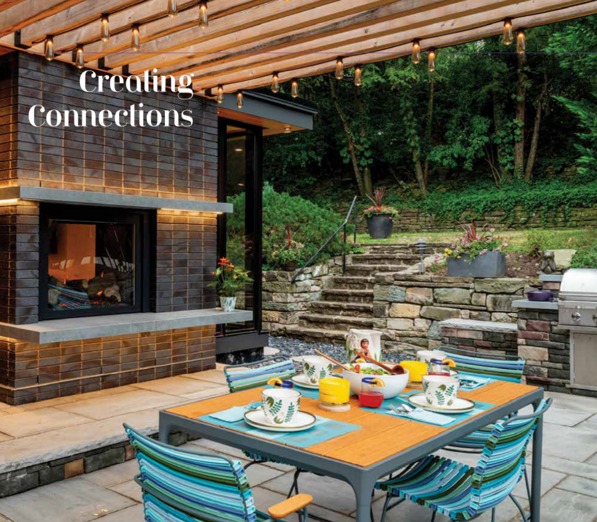
The outdoor dining area, under the pergola.

APPOINTMENTS THAT ALLOW A SEAMLESS TRANSITION TO THE OUTSIDE “ROOM” INCLUDE A PERGOLA ON THE SLATE TERRACE, ONE OF THE LEVELS OF THIS MULTITIERED BACKYARD.