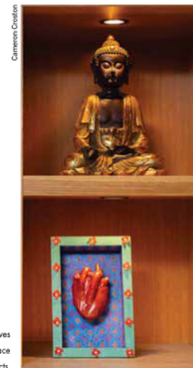
Recessed shelves beside the fireplace showcase art objects.

The Lipsitz's house was a classic Pittsburgh red-brick box built in 1948, with just one owner before they bought the property in 2019. They wanted to put their mark on it, but took some time considering options. In 2023, they began working with Margittai Architects, a South Side firm, with the central question: