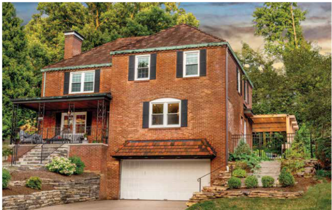
The Lipsitz house as seen from Beechwood Boulevard.