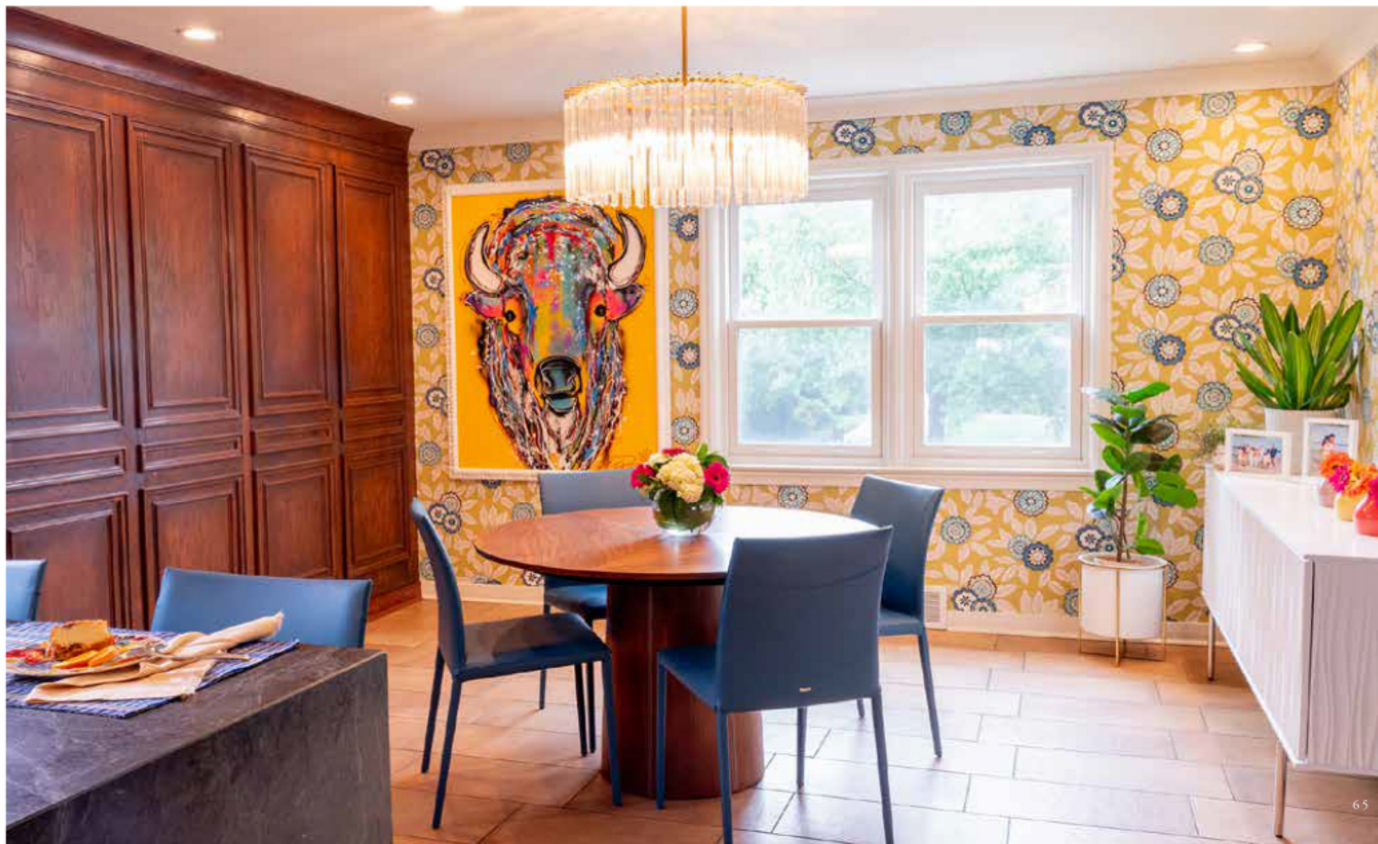
The breakfast room, with the original wood-paneled storage cabinets and a painting by Baron Batch.