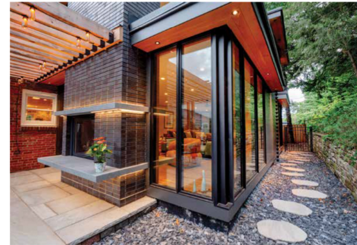
The addition, seen from the backyard.